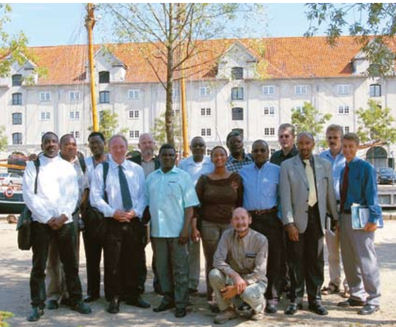
The SADSEM 'PhD team' with colleagues from the Danish Institute for International Studies, after a visit to the Danish Foreign Ministry, Copenhagen.

In July 2006 a 13-strong team of PhD students and supervisors visited Denmark for a series of seminars at the Danish Institute for International Studies (DIIS), to further develop their understanding of approaches to security and research. Sessions were held on approaches to security, research methodology, global security agendas, and security and development amongst others.