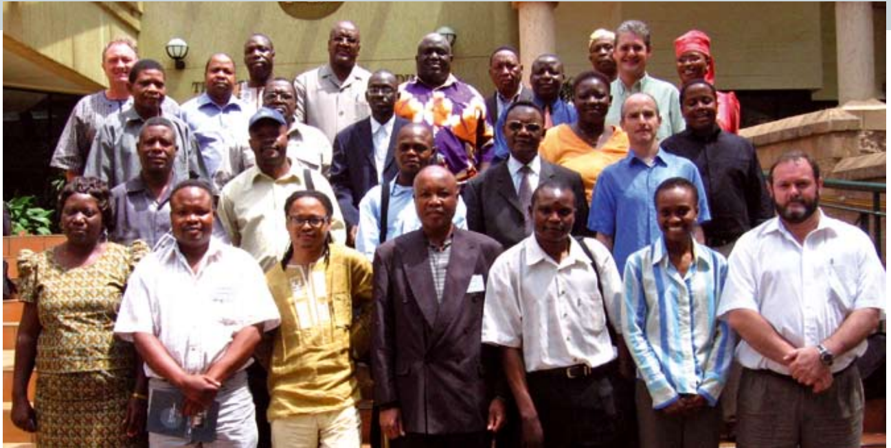
Ssg programme course participants.